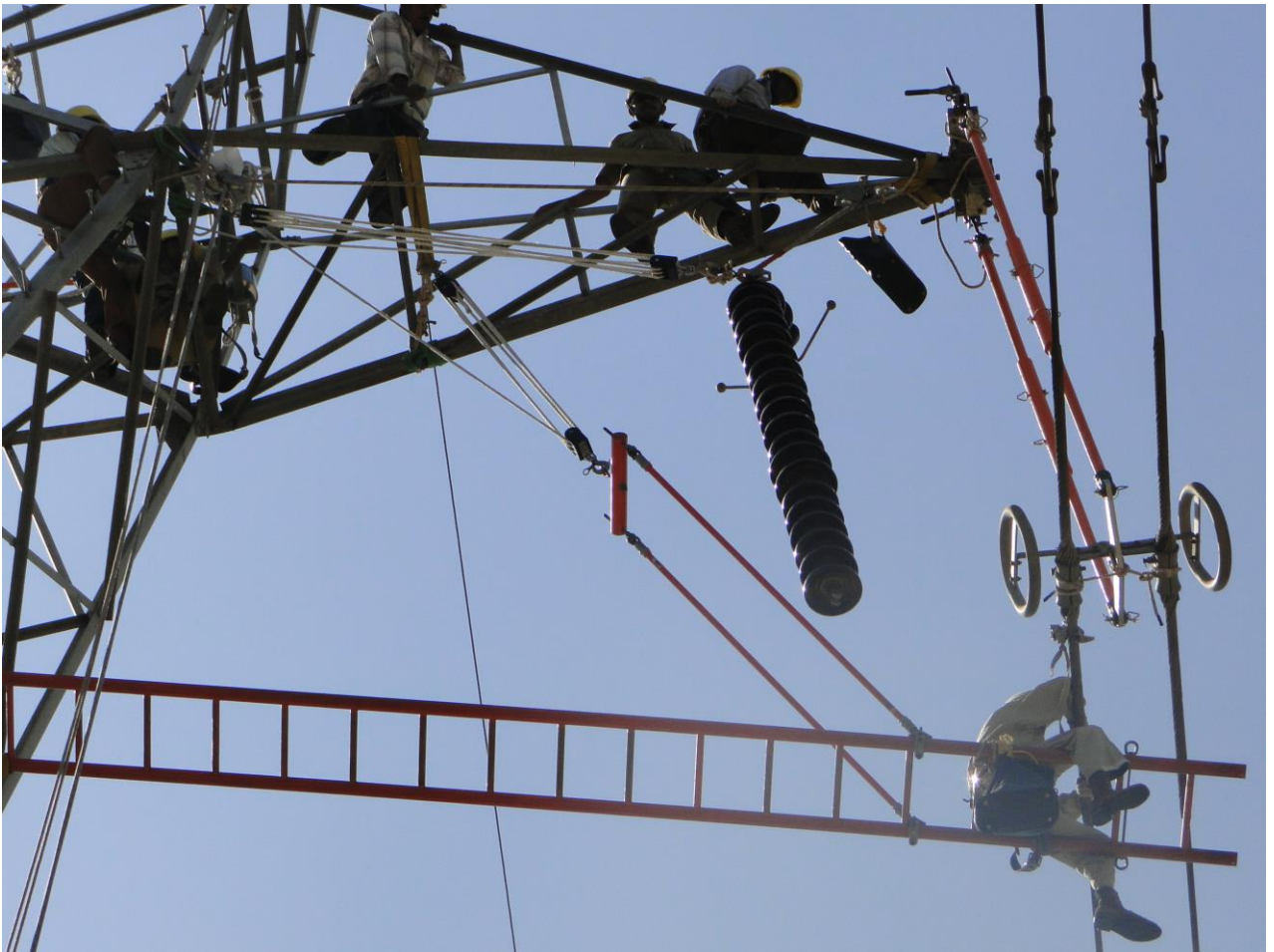
400 KV Suspension Operation