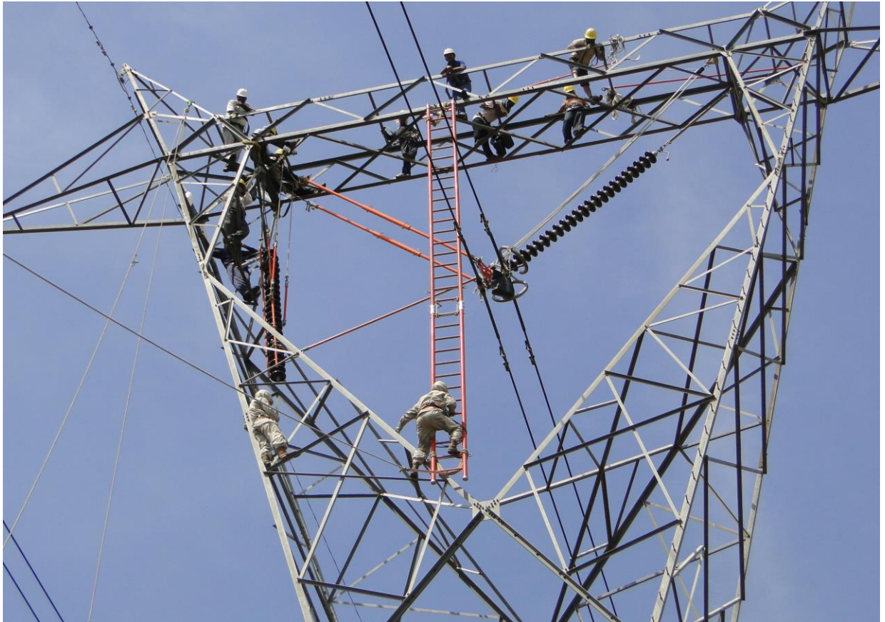
400 KV "V" String Operation