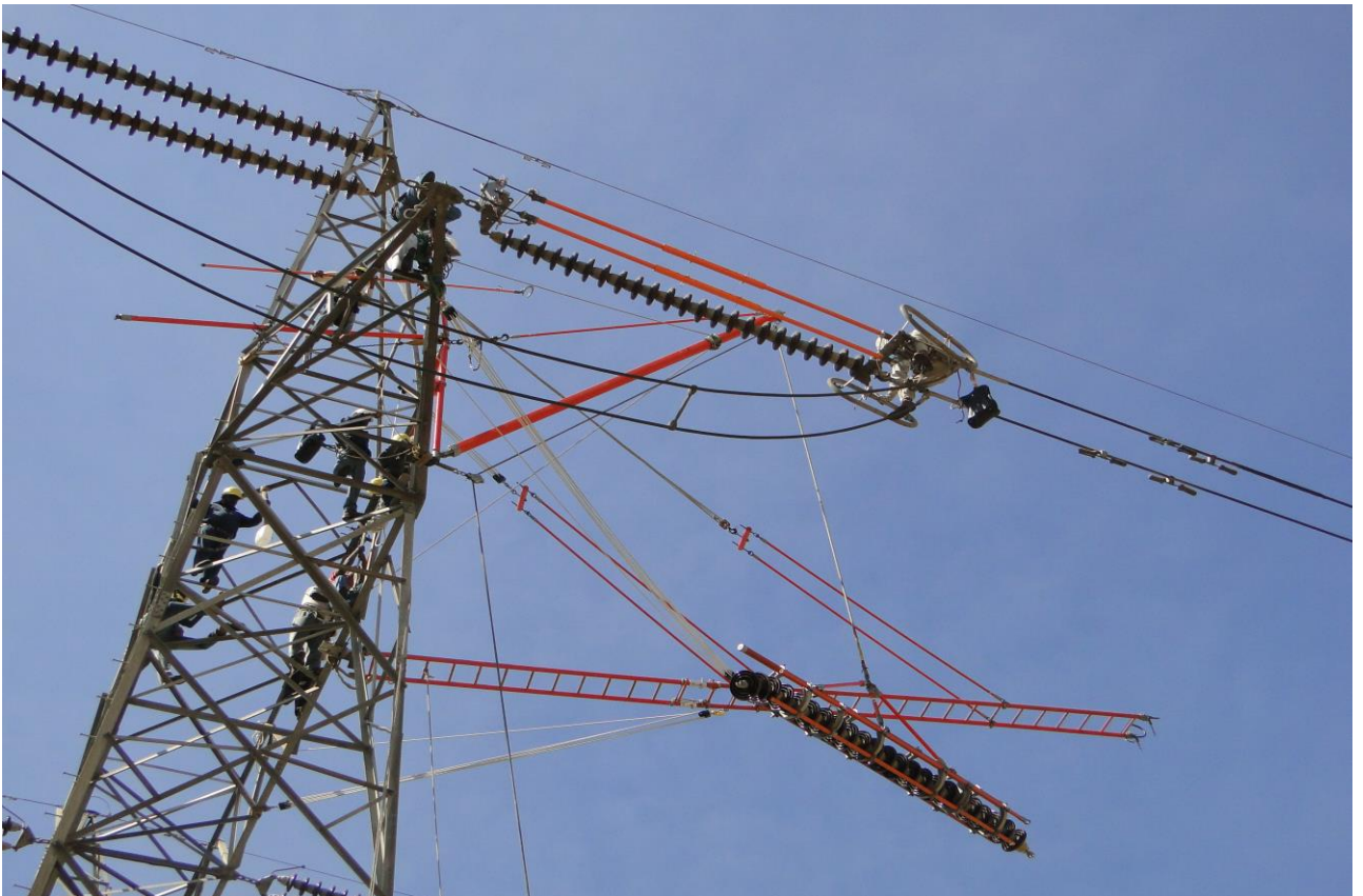
400 KV Tension Operation