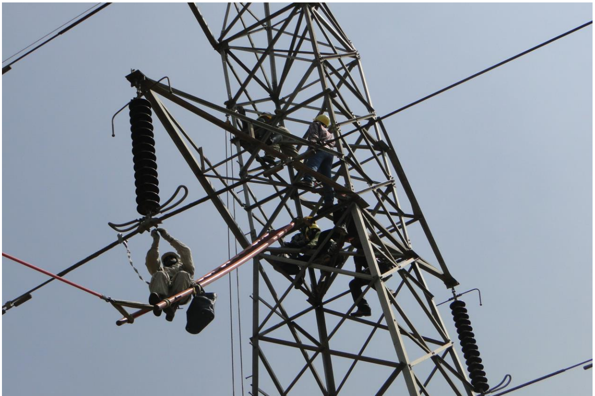
220kV Suspension Operation